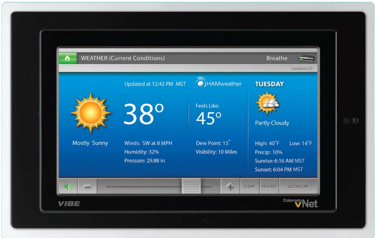
Weather Application Screen on Vibe Color Touchscreen with Black Bezel