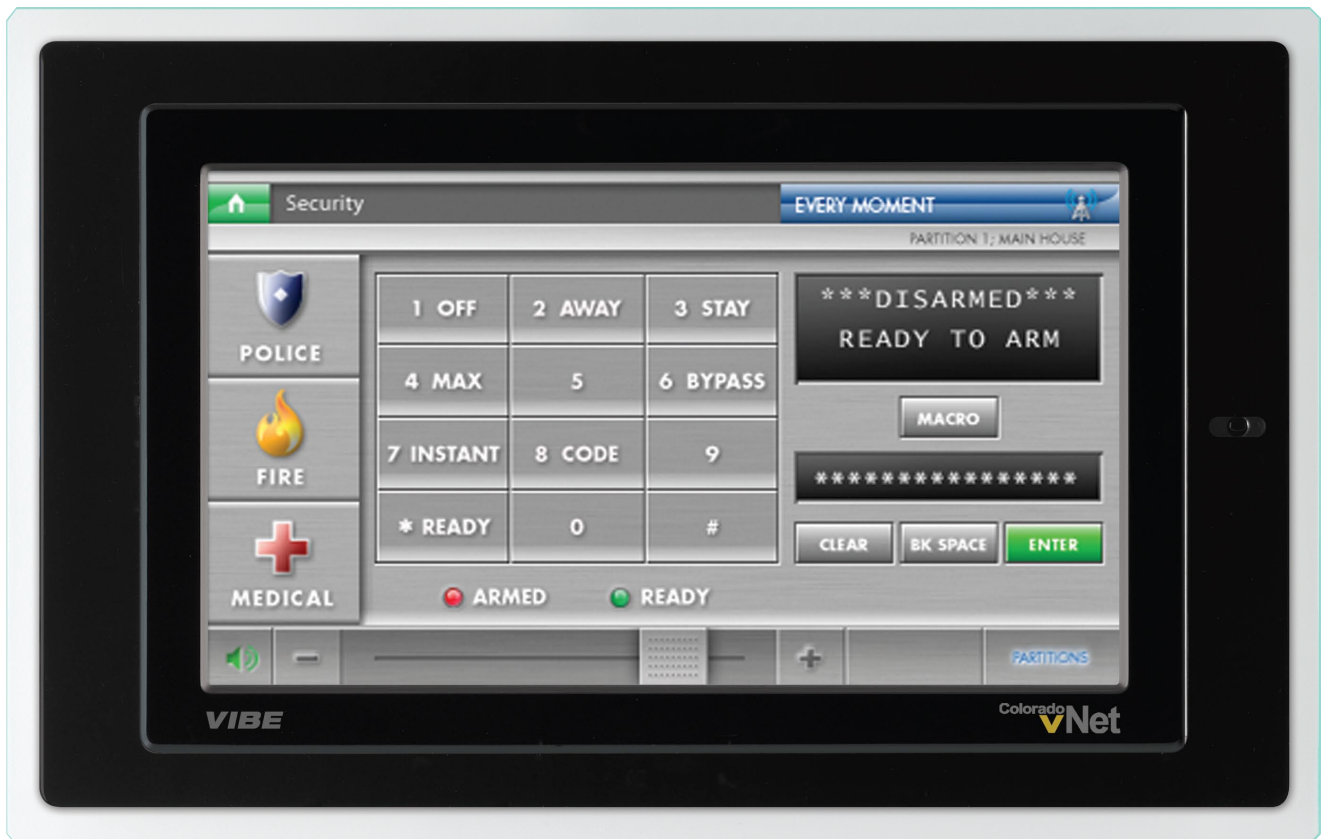
Honeywell Security Application Screen on Vibe Color Touchscreen with black bezel